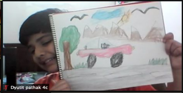
Dyutit pathak 4c